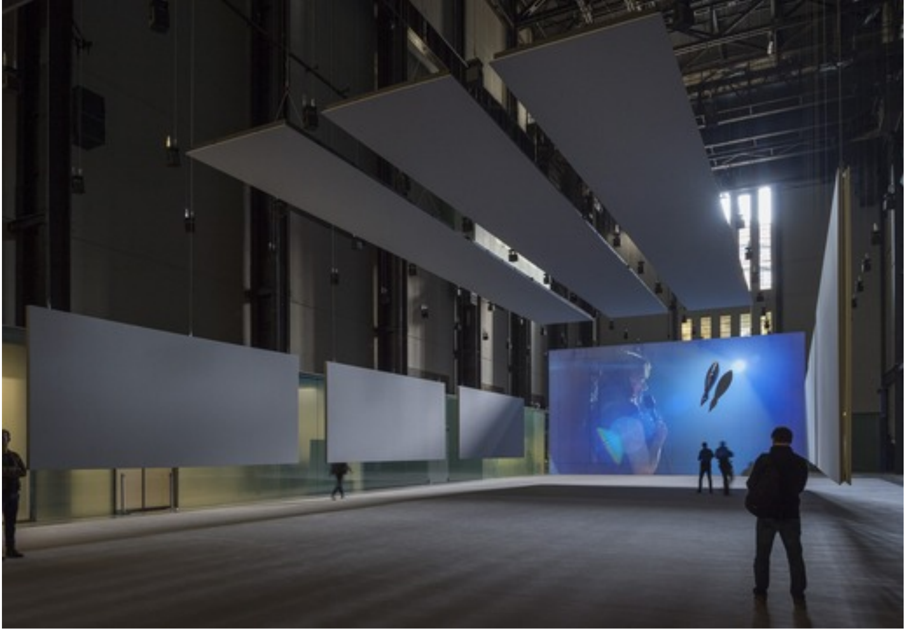
Installation view of the Hyundai Commission 2016: Philippe Parreno, Anywhen

You've said that you thought of the Palais de Tokyo as a garden and New York's Park Avenue Armory as a city plaza—so how do you view the Turbine Hall?