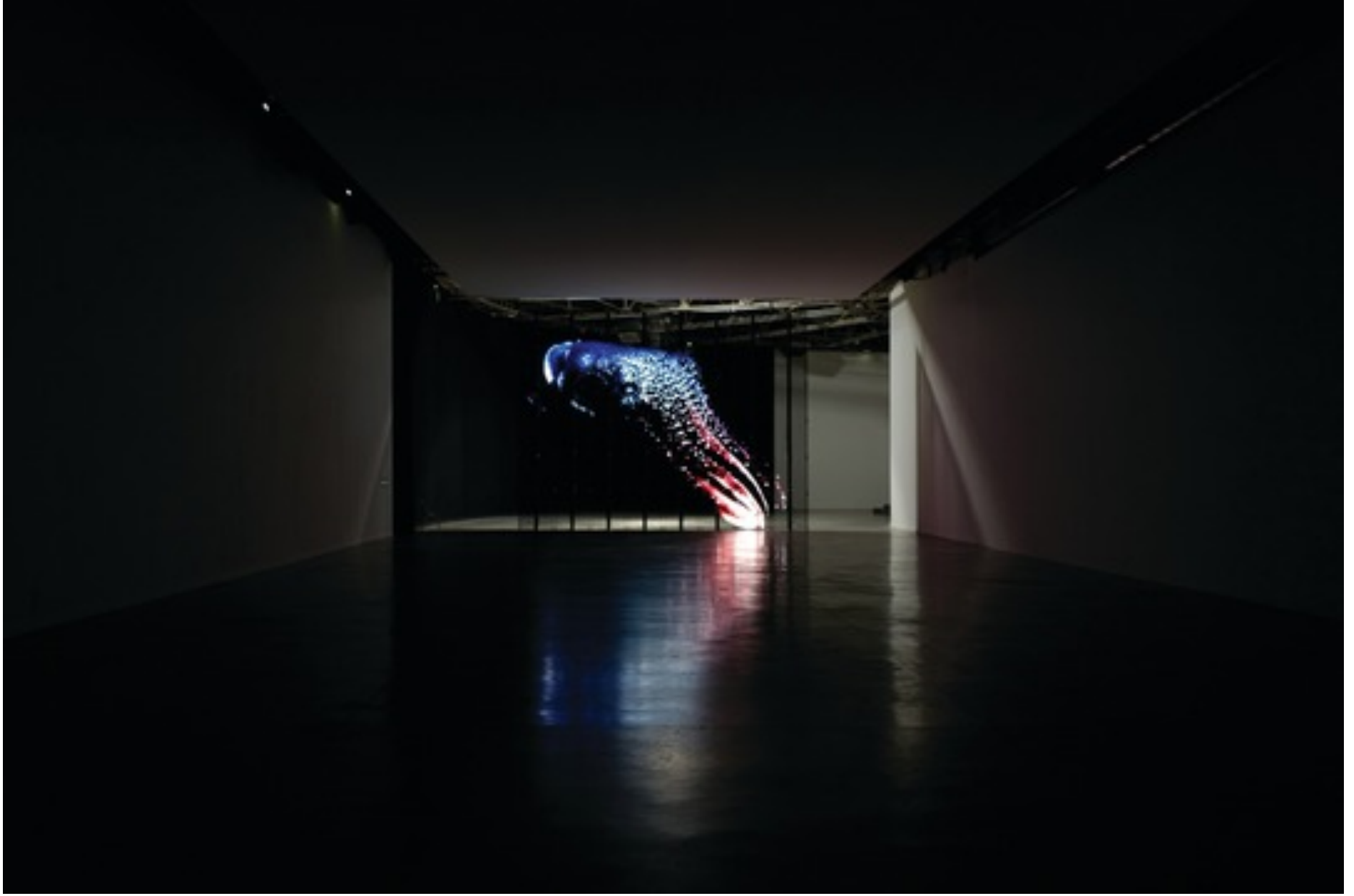
Philippe Parreno, Anywhere, Anywhere, Out of the World , exhibition view, Palais de Tokyo, 2013.