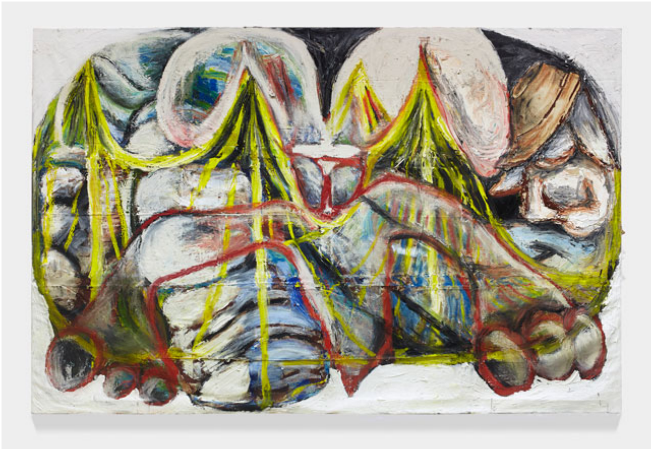
Gerasimos Floratos. Triborough force field, 2016. Oil on canvas, 167.6 x 259 cm (66 x 102 in).