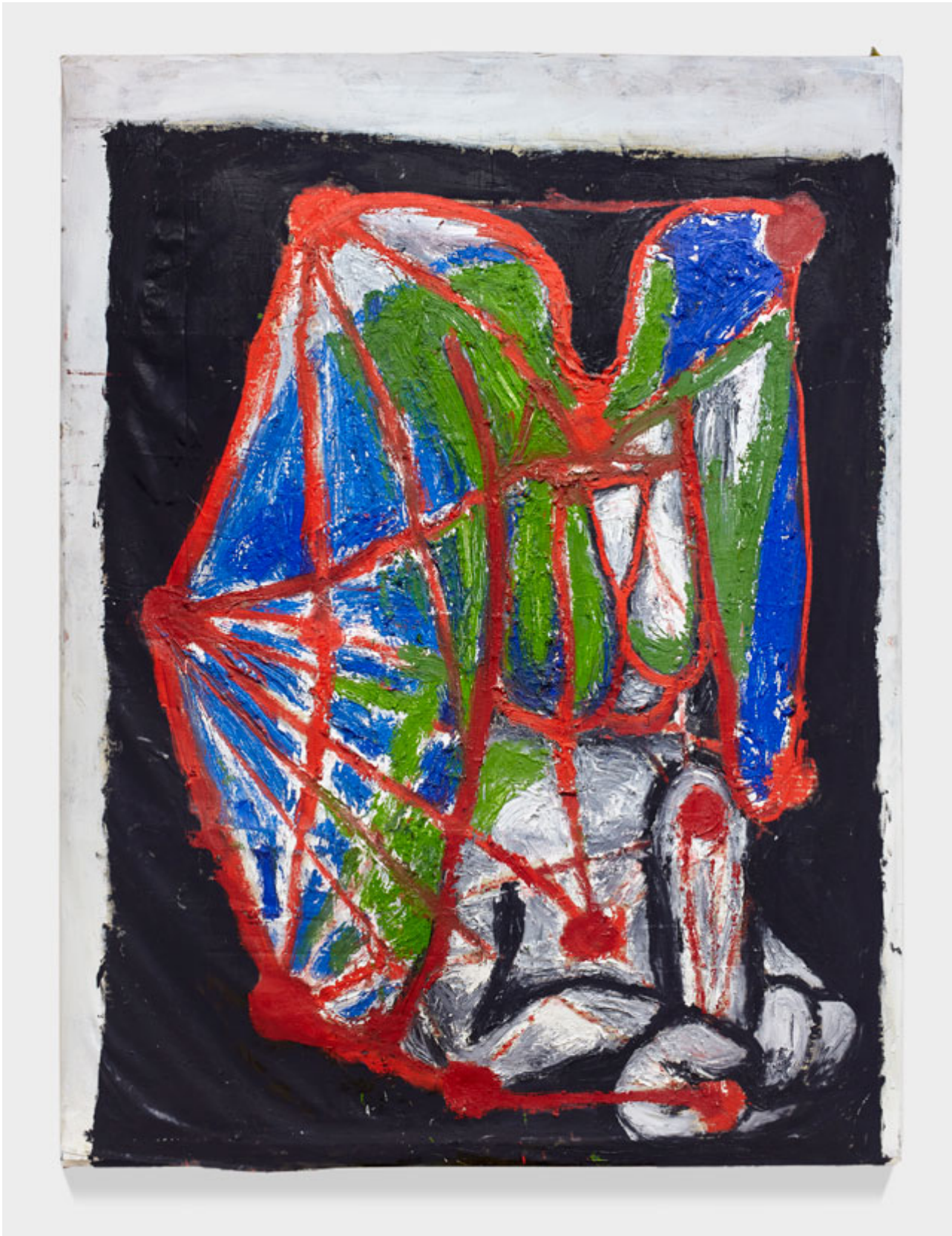
Gerasimos Floratos. 1 ove, 2016, Oil on canvas, 223.5 x 167.6 cm (88 x 66 in).