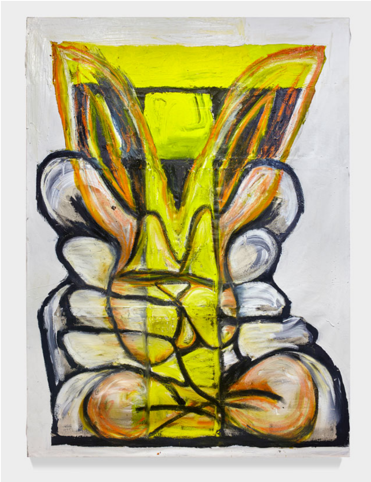
Gerasimos Floratos. TS Post-Up, 2016. Oil and acrylic on canvas, 172.7 x 243.8 cm (68 x 96 in).