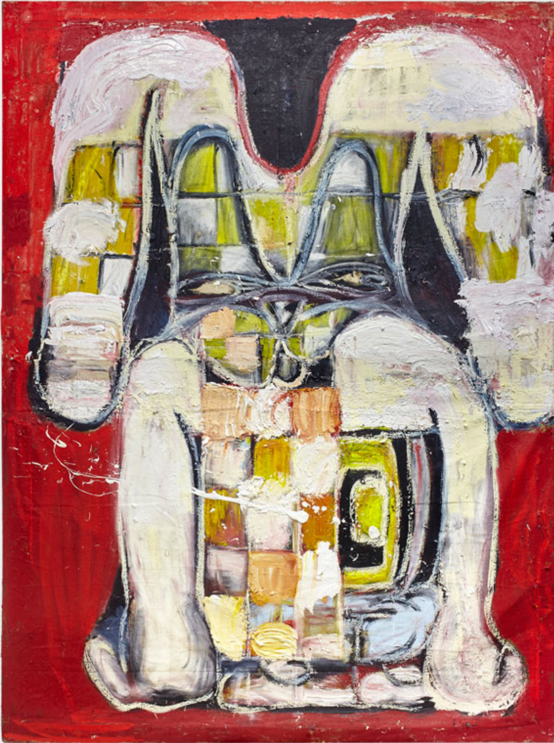
Gerasimos Floratos. Little taxi boy, 2016. Oil on canvas, 221 x 167.6 cm (87 1/8 x 66 in).