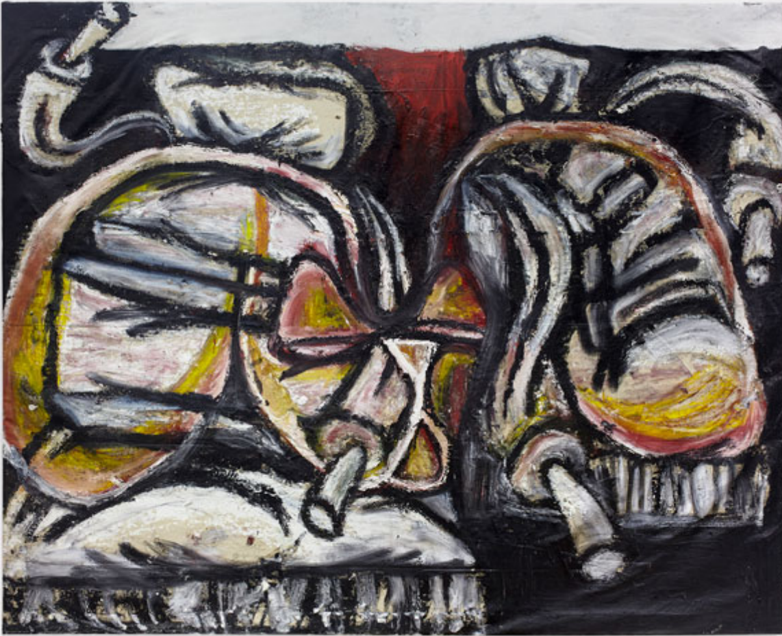
Gerasimos Floratos. TS Minion Alignment, 2016. Oil and acrylic on canvas, 162.6 x 198.1 cm (64 1/8 x 78 in).