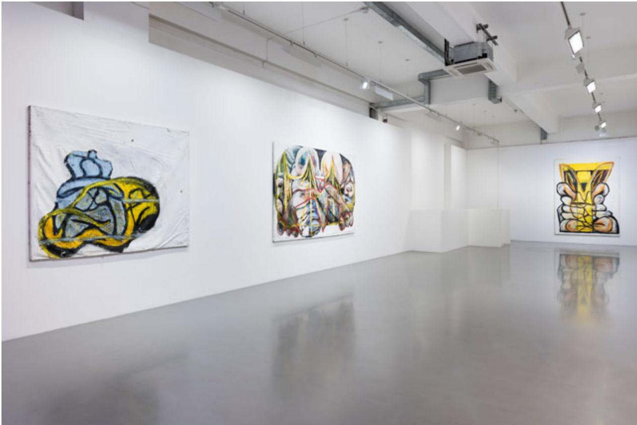
Gerasimos Floratos: Big Town. Installation view.